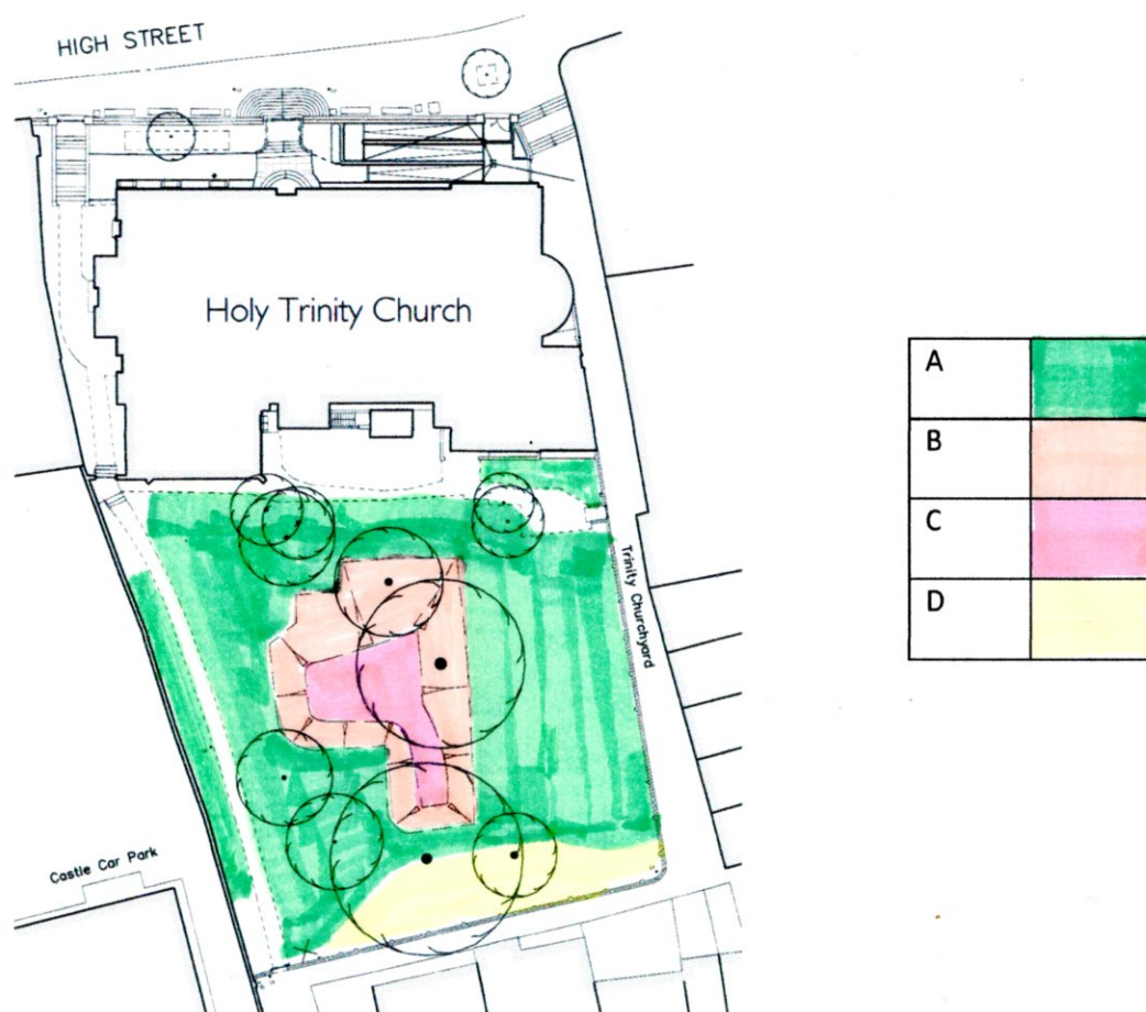
Figure 2: Churchyard Management Plan